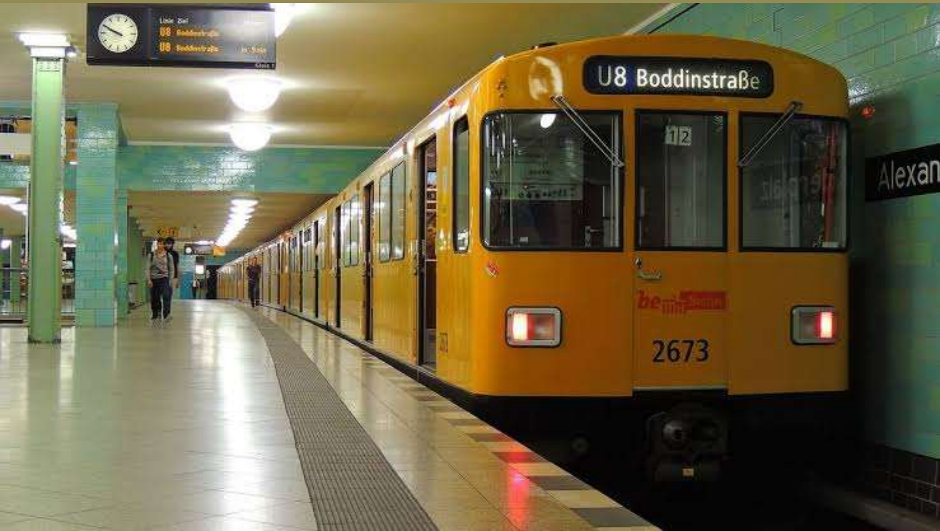
PUBLIC TRANSPORT - METRO